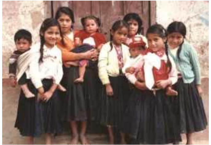
Young Panao Quechua girls