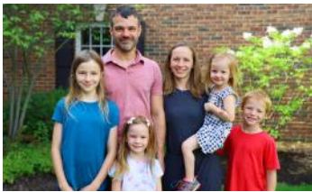
B & J* M, O, P, P *Names withheld for security purposes