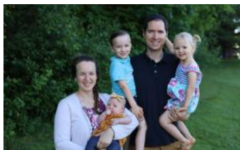
E & J*