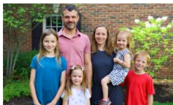
B & J*