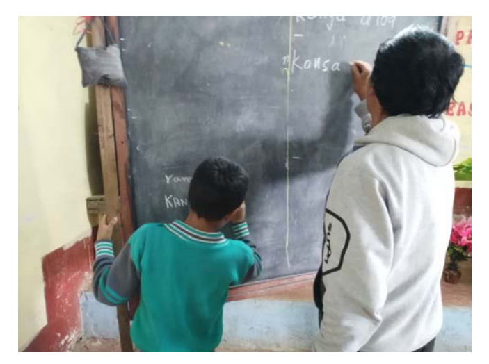
Men and women, young and old, on white boards, blackboards and pieces of paper practice away. Everywhere the big question is: When will our Bibles arrive?

The Quechua Bibles that are waiting to be printed use a slightly different spelling system than the previously published New Testaments. So, our Quechua co-workers have made it a point to get out and help prepare people by organizing reading and writing practice. A number of churches in the Huánuco area have hosted series of classes.