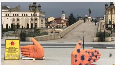
Right: Mike's last view of the stone bridge in Skopje during social distancing.