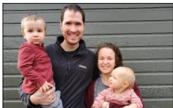
E & J*