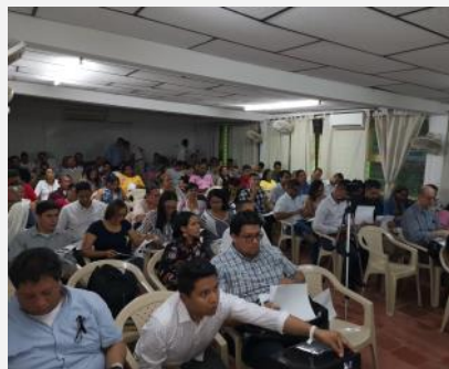
Fundamentos pastors' conferences in Colombia