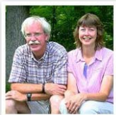
The Collins Family