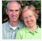
The Bean Family