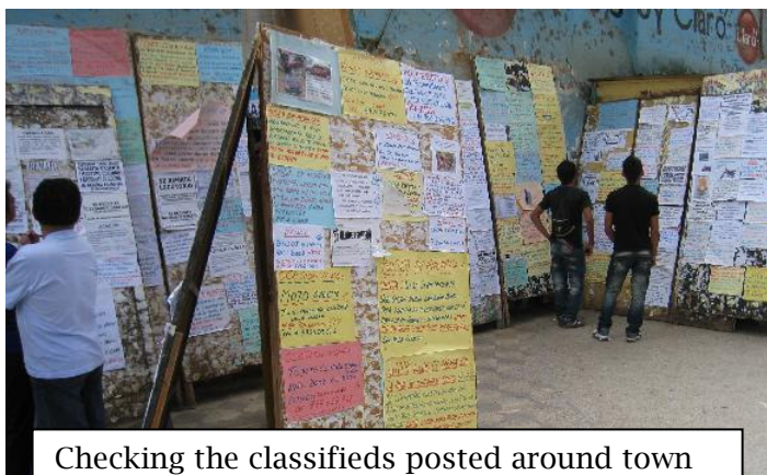
Checking the classifieds posted around town

We've scheduled our next two workshops in Huánuco. That will give me the opportunity to check things out when I'm not busy helping Mark. The "classifieds" are posted around town in a couple locations rather than in a local newspaper. So, to keep up means walking back and forth to see if anything new has been posted.