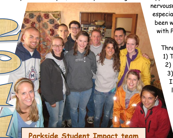
Parkside Student Impact team