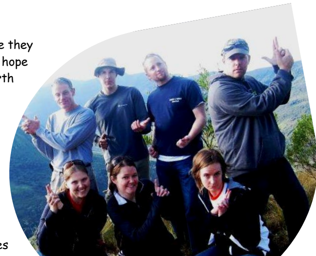
Parkside Transit Ministry team

I had planned to have this be a work team, little did any of us realize just how physically challenging it would be. It's amazing how much work can be done with some work gloves, wheelbarrows and machetes! We all worked very hard and had a great time together.