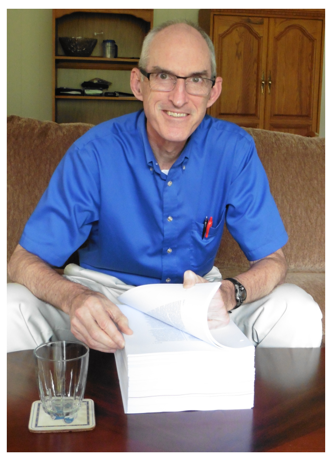
That's a STACK of pages!

Translating all of God's Word for six different groups of Quechua speakers in central Peru