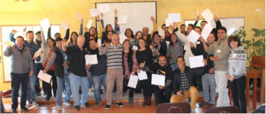
ESI Facilitator Training in Tumuco, Chile