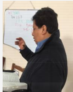
ESI Facilitator Training in Salta, Argentina