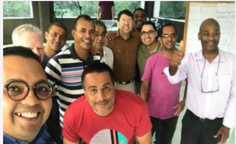
ESI Facilitator Training in Sao Paulo, Brazil