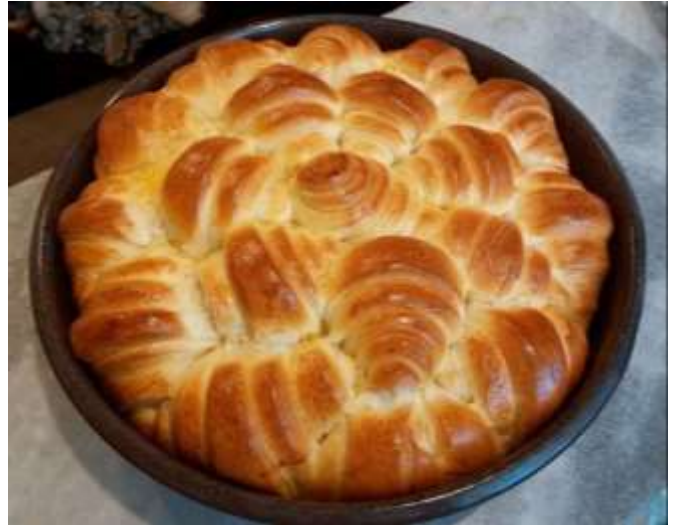
Christmas "Порача" bread